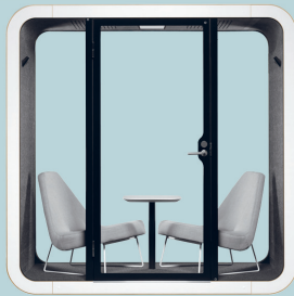
FRAMERY Q enables private meetings for 1-4 users.

Users should be able to walk to the booth in a few seconds when their phone rings, or to have a spontaneous discussion with a colleague.