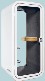
FRAMERY O is typically used for phone calls and concentration.

Open offices enable free-flowing ideas between employees. However, noise is a common problem. Almost 50 percent of employees in open offices say the lack of sound privacy is the most frustrating aspect in their workplace. Installing sound insulated high-quality privacy spaces in offices significantly increases satisfaction and efficiency in the workplace.