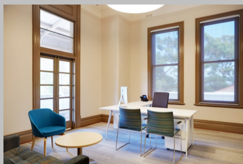
cancer support wa