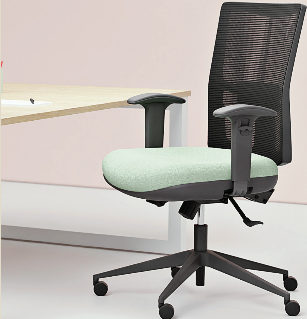
Squad Task Chair