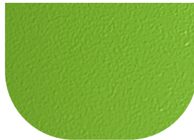
Green Ferrotex (Lime)