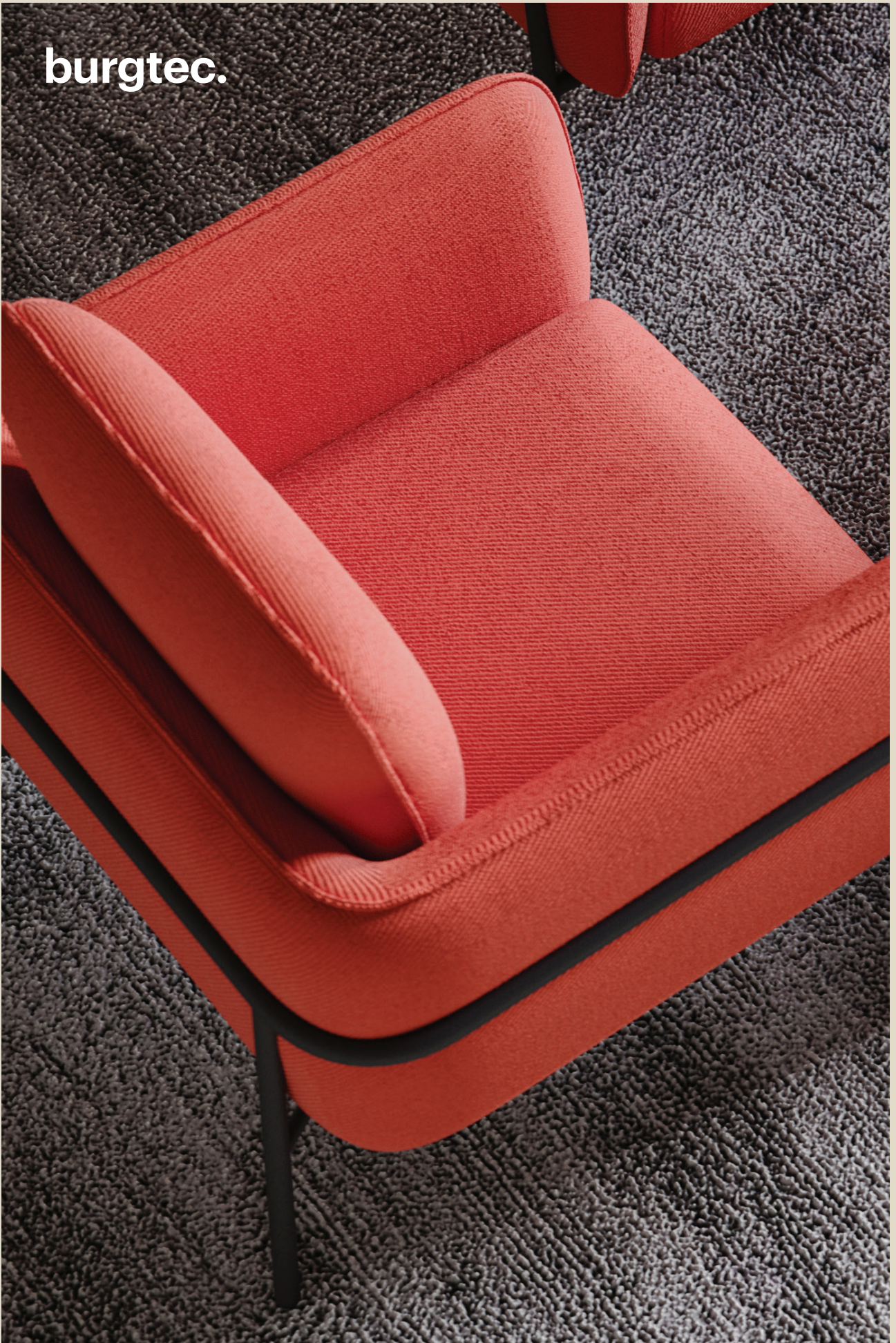
Merlot Lounge Chair & Sofa