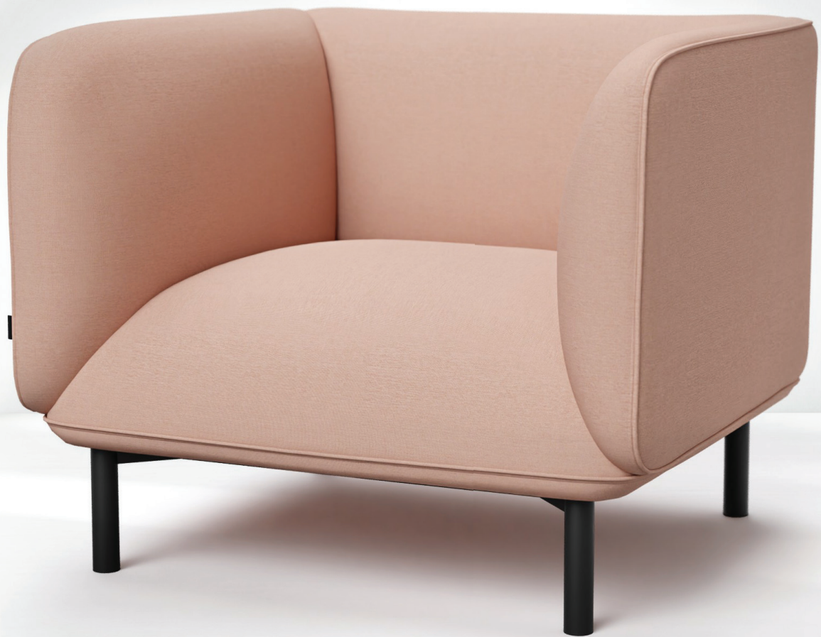
Tommy Lounge Chair & Sofa