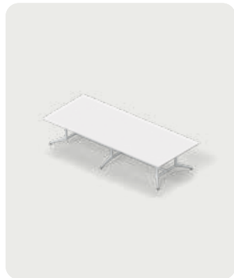
Arcade Meeting Rectangle Table 1500D x 3000-3600W - Core Frame

Depth 1200mm Height 720mm Width 4200-4800mm