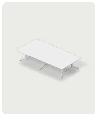
Arcade Meeting Rectangle Table 1800D x 3000-3600W - Core Frame

Depth 1500mm Height 720mm Width 4200-4800mm