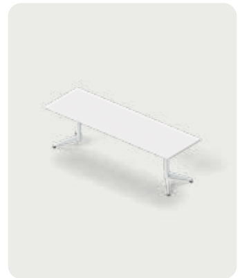
Arcade Meeting Rectangle Table 750D x 1800-2400W - Curated Frame

Depth 750mm Height 720mm Width 1800-2400mm