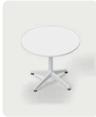
Arcade Round Table 750-900DIA - Curated Frame