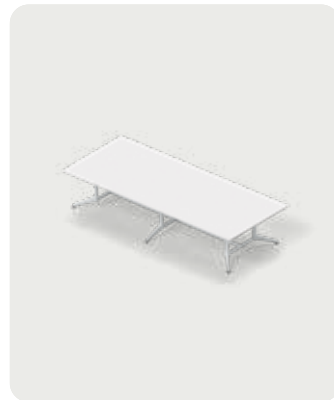
Arcade Meeting Rectangle Table 1500D x 3000-3600W - Curated Frame

Depth 1500mm Height 720mm Width 3000-3600mm