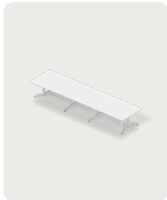
Arcade Meeting Rectangle Table 1200D x 4200-4800W - Curated Frame

Depth 1200mm Height 720mm Width 4200-4800mm