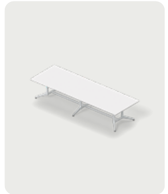
Arcade Meeting Rectangle Table 1200D x 3000-3600W - Curated Frame

Depth 1200mm Height 720mm Width 3000-3600mm