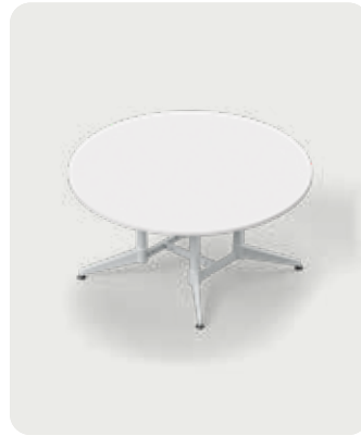
Arcade Round Table 1200-1800DIA - Core Frame