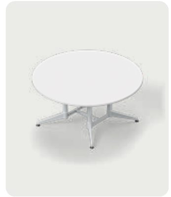
Arcade Round Table 1200-1800DIA - Curated Frame