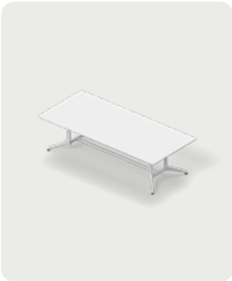
Arcade Meeting Rectangle Table 1200D x 1800-2700W - Core Frame

Depth 900mm Height 720mm Width 1800-2700mm