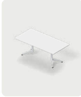
Arcade Meeting Rectangle Table 900D x 1200-1800W - Curated Frame

Depth 900mm Height 720mm Width 1200-1800mm