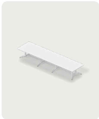
Arcade Meeting Rectangle Table 1200D x 4200-4800W - Core Frame