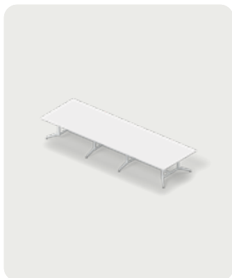
Arcade Meeting Rectangle Table 1500D x 4200-4800W - Core Frame

Depth 1500mm Height 720mm Width 3000-3600mm