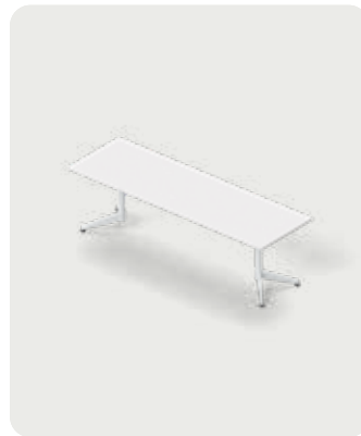
Arcade Meeting Rectangle Table 750D x 1800-2400W - Core Frame

Depth 750mm Height 720mm Width 1200-1800mm