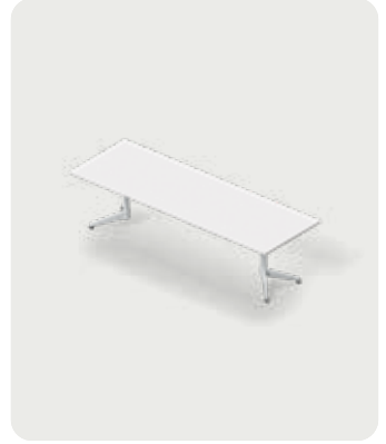
Arcade Meeting Rectangle Table 900D x 1800-2700W - Curated Frame

Depth 900mm Height 720mm Width 1800-2700mm