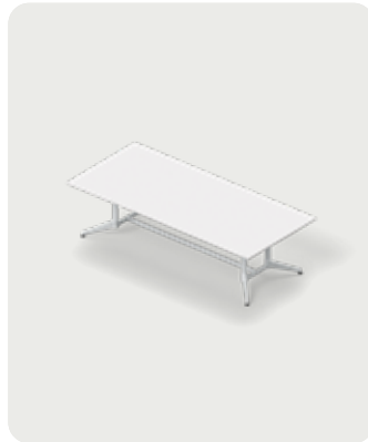
Arcade Meeting Rectangle Table 1200D x 1800-2700W - Curated Frame

Depth 1200mm Height 720mm Width 1800-2700mm