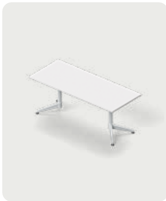
Arcade Meeting Rectangle Table 750D x 1200-1800W - Core Frame