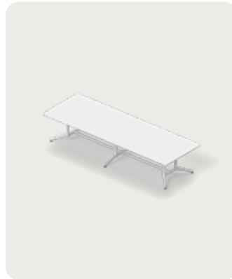
Arcade Meeting Rectangle Table 1200D x 3000-3600W - Core Frame

Depth 1200mm Height 720mm Width 1800-2700mm