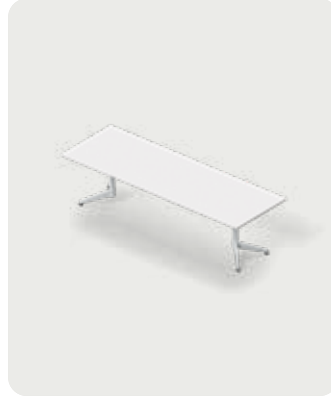
Arcade Meeting Rectangle Table 900D x 1800-2700W - Core Frame

Depth 900mm Height 720mm Width 1200-1800mm