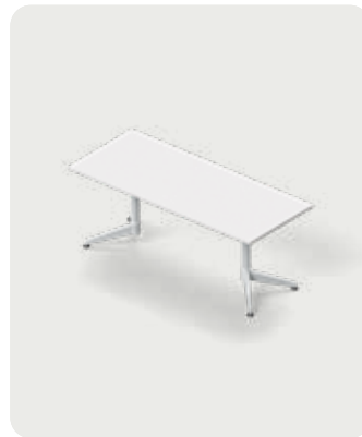
Arcade Meeting Rectangle Table 750D x 1200-1800W - Curated Frame

Depth 750mm Height 720mm Width 1200-1800mm