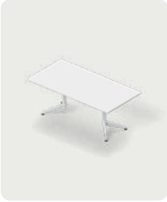
Arcade Meeting Rectangle Table 900D x 1200-1800W - Core Frame