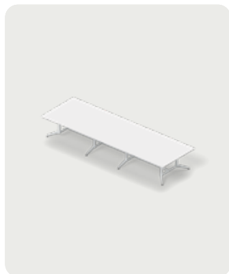
Arcade Meeting Rectangle Table 1500D x 4200-4800W - Curated Frame

Depth 1500mm Height 720mm Width 4200-4800mm