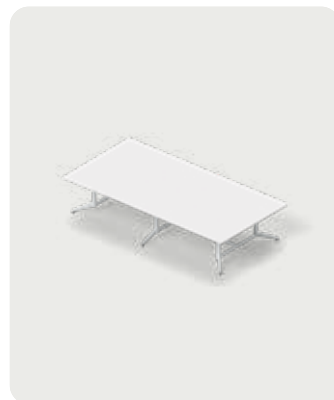
Arcade Meeting Rectangle Table 1800D x 3000-3600W - Curated Frame

Depth 1800mm Height 720mm Width 3000-3600mm