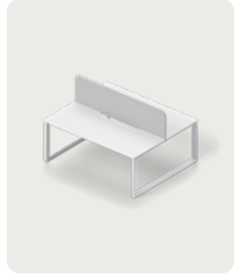
Stream O Fixed Workstation - Back-to-Back - Aura Desk Mounted Screen - Curated Powdercoat