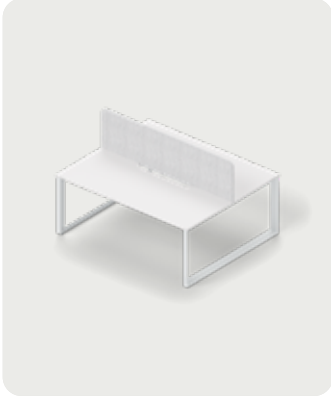
Stream O Fixed Workstation - Back-to-Back - Aura Desk Mounted Screen - Core Powdercoat