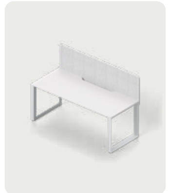
Stream O Fixed Workstation - Single Sided - Aura Desk Mounted Screen - Curated Powdercoat