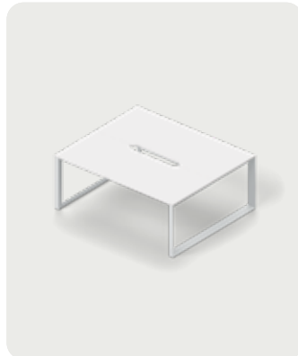
Stream O Fixed Workstation - Back-to-Back - No Screen - Curated Powdercoat