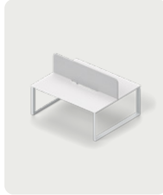
Stream O Fixed Workstation - Back-to-Back - Aura Desk Mounted Screen - Core Powdercoat