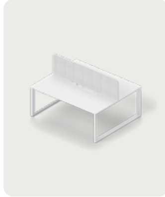
Stream O Fixed Workstation - Back-to-Back - Aura Desk Mounted Screen - Curated Powdercoat