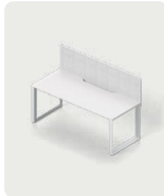
Stream O Fixed Workstation - Single Sided - Aura Desk Mounted Screen - Core Powdercoat