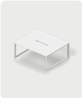
Stream O Fixed Workstation - Back-to-Back - No Screen - Core Powdercoat