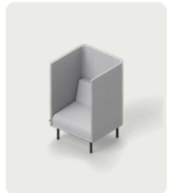
Lounge - Tall Back - 1-Seater No Media Table