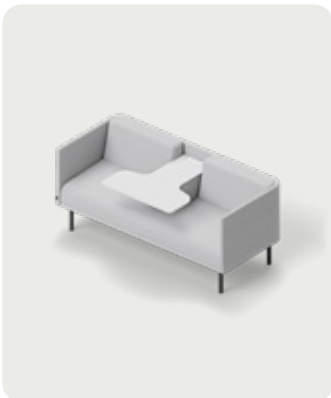
Lounge - Standard Back - 2-Seater Shared Media Table