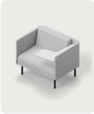
Lounge - Standard Back - 1-Seater Left-Hand Media Table