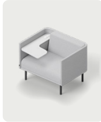
Lounge - Standard Back - 1-Seater Right-Hand Media Table