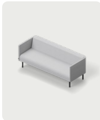
Lounge - Standard Back - 3-Seater No Media Table