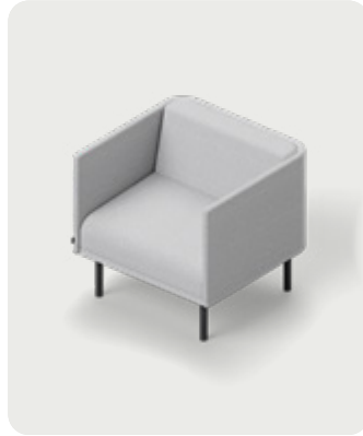
Lounge - Standard Back - 1-Seater No Media Table