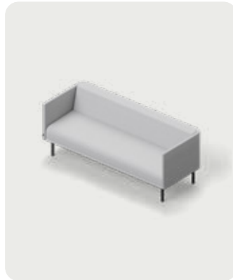
Quest Lounge - Standard Back - 3-Seater No Media Table - Curated Upholstery