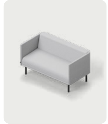
Quest Lounge - Standard Back - 2-Seater No Media Table - Curated Upholstery