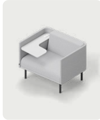
Quest Lounge - Standard Back - 1-Seater Right-Hand Media Table - Curated Upholstery