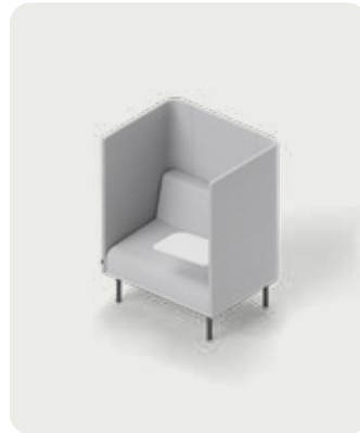
Quest Lounge - Tall Back - 1-Seater Left-Hand Media Table - Curated Upholstery