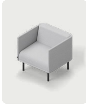
Quest Lounge - Standard Back - 1-Seater No Media Table - Curated Upholstery