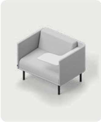
Quest Lounge - Standard Back - 1-Seater Left-Hand Media Table - Curated Upholstery