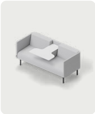
Quest Lounge - Standard Back - 2-Seater Shared Media Table - Curated Upholstery