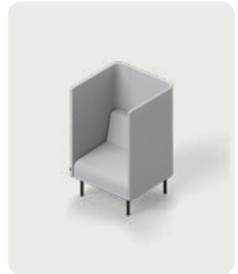
Quest Lounge - Tall Back - 1-Seater No Media Table - Curated Upholstery